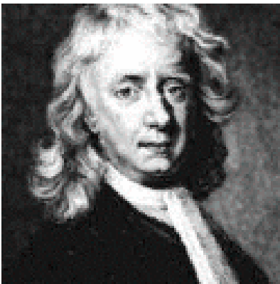
Sir Isaac Newton

Sir Isaac Newton was born in England on Christmas day in 1642. He was a physicist and mathematician and is considered one of the most influential scientists of all time.