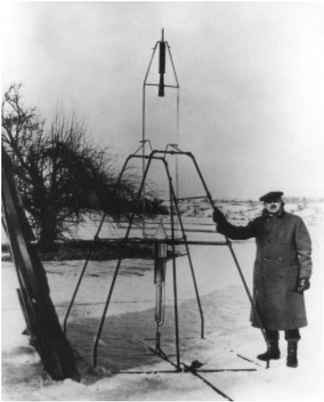
Robert Goddard

As electric power came to American cities in the 1880s, a young boy by the name of Robert Goddard started his life-long interest in science and technology. As a five-year-old, he was fascinated by static electricity generated from the family's carpet. To further the young Robert's scientific interests, his father provided him with a microscope, a telescope, and a subscription to Scientific American. Goddard would go on to become the man many considered to be the "Father of Modern Rocketry."